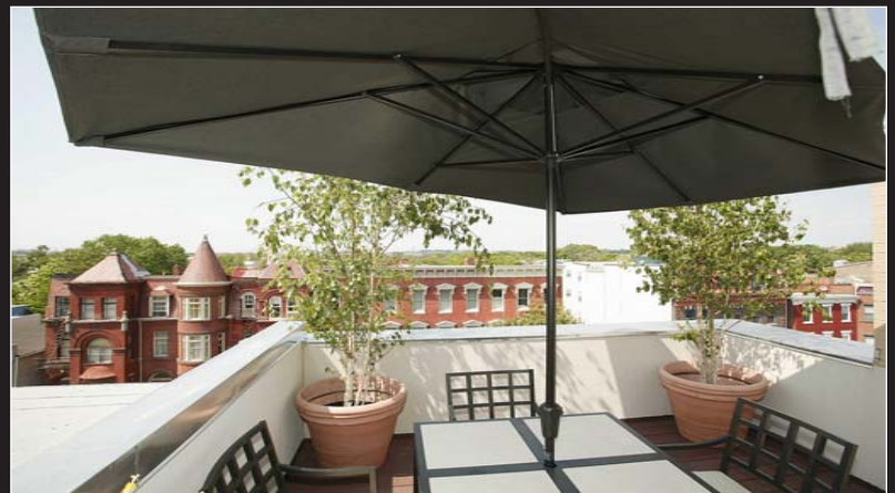
Front Roof Top Terrace

This material is based upon information which we consider reliable, but because it has been supplied by third parties, we cannot represent that it is accurate or complete, and it should not be relied upon as such.