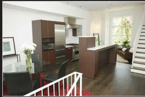
Open Living Space