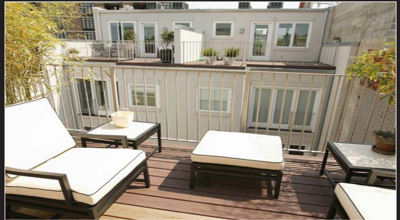
Rear Roof Top Terrace

Secure Garage Parking Available ($40,000)